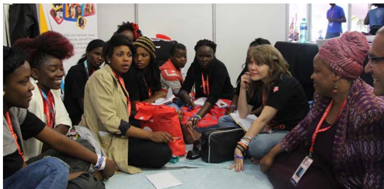
World YWCA safe space at International AIDS Conference 2016