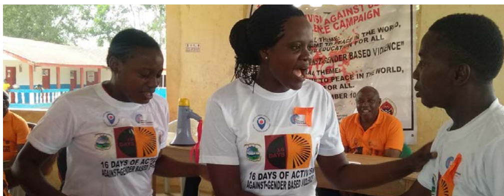
Youth drama during the 16 days of activism against gender based violence