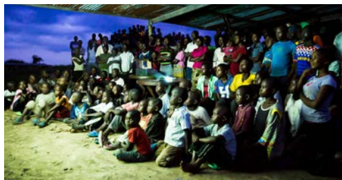
Over 250 people attended the first screening of Girl Rising at a local school in Gbadolite

Girl Rising began in 2013 as a touching documentary on educating girls, and has become a global campaign that uses the power of storytelling to share the simple truth that educating girls can transform societies.