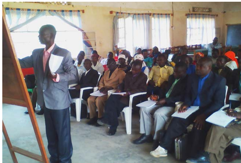
GBV workshop with men in Liberia