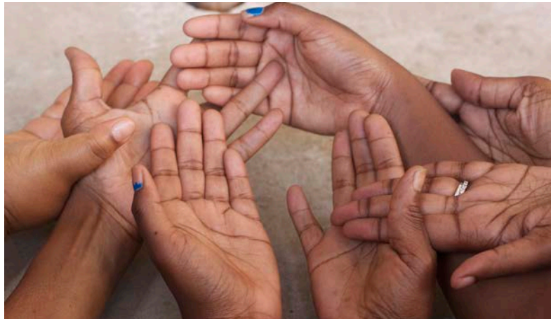
Women support group